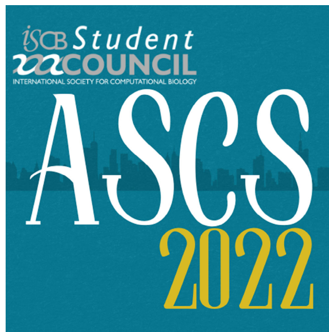
Figure 1. 1st ASCS 2022 Logo.

Due to the COVID-19 pandemic, the ISCB and ISCB-SC organized their flagship activities virtually during 2020 and 2021, and they evolved into hybrid events in 2022. Implementing virtual and hybrid modalities has allowed ISCB to bring the content from its main conferences to the world and to promote research from regions where researchers cannot travel on-site due to economic and visa-related issues. Both modalities achieved an increase in equity, diversity, and inclusivity globally in computational biology. Due to these reasons, 1st ASCS was planned as a virtual event. The virtual setup also